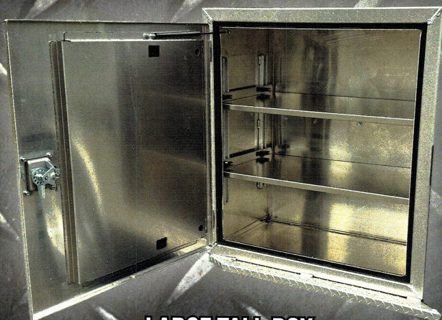
LARGE TALL BOX WITH OPTIONAL SHELVES