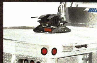
OPTIONAL HILLSBORO B&W CONVERSION KIT & B&W FLATBED COMPANION HITCH