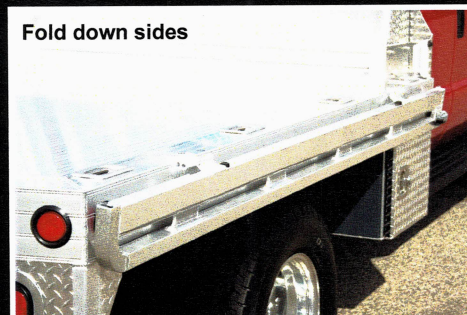
Fold down sides