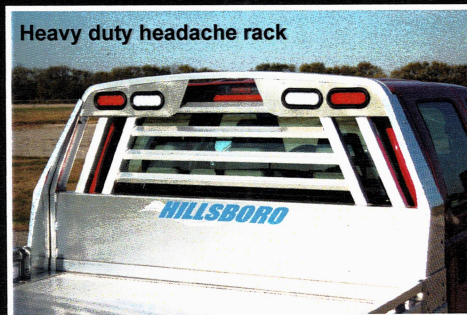
Heavy duty headache rack