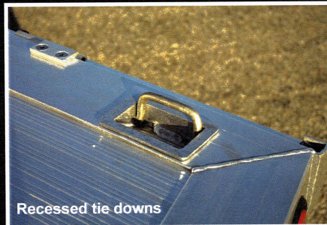
Recessed tie downs