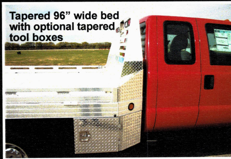
Tapered 96" wide bed with optional tapered tool boxes