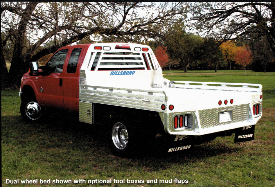
Dual wheel bed shown with optional tool boxes and mud flaps