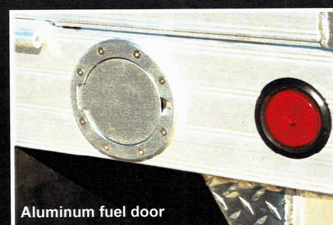
Aluminum fuel door