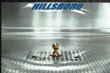
OPTIONAL HILLSBORO B&W CONVERSION KIT

PLUG AND PLAY WIRE HARNESS ADAPTERS FOR DIFFERENT MODEL AND OEM TRUCKS