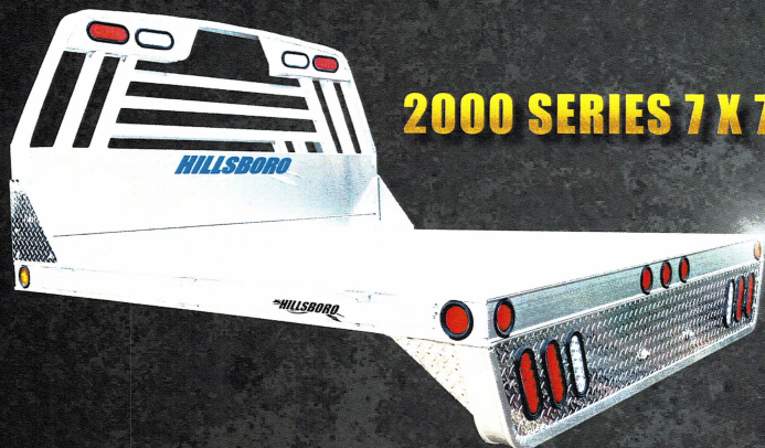
2000 SERIES 7 X 7 BED