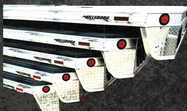
OPTIONAL HILLSBORO 2000 SERIES CHAMFERED REAR CORNERS