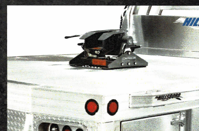
OPTIONAL HILLSBORO B&W CONVERSION KIT & B&W FLATBED COMPANION HITCH