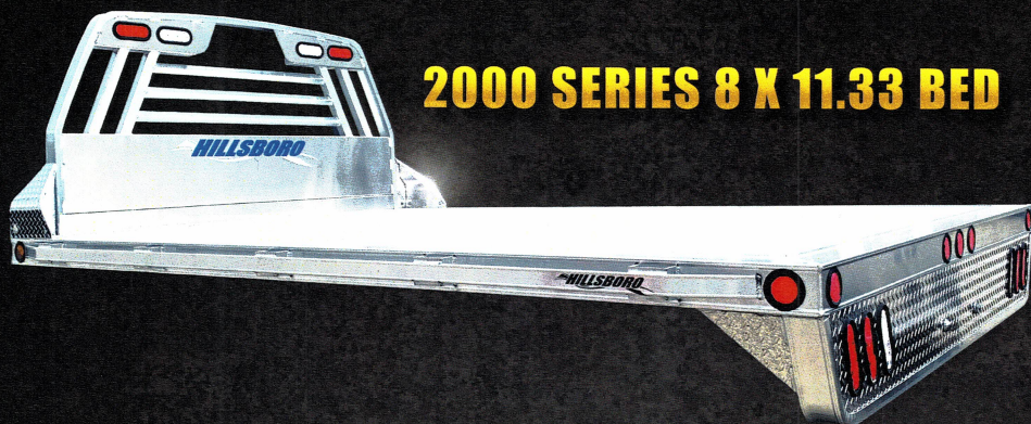
2000 SERIES 8 X 11.33 BED