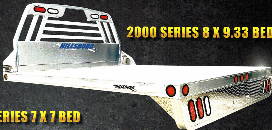
2000 SERIES 8 X 9.33 BED