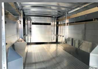
Adjustable solid center gate and plexiglass in front of fender in an 8'2" trailer