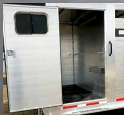
4' straight-wall tack room with window in door, black painted nose, windows in nose, brush tray, blanket bar and 6 hook bars