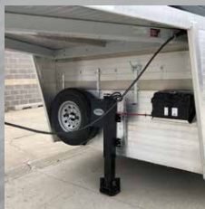
Front vent and electric/hydraulic jack