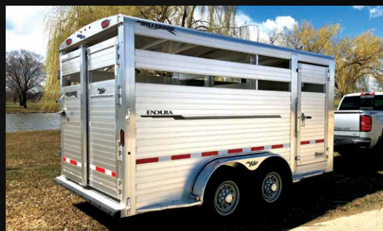
7' x 14' bumper-pull stock trailer