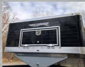
Black painted nose and access door