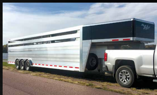
7'6" x 34' with black painted nose and triple 7k axles