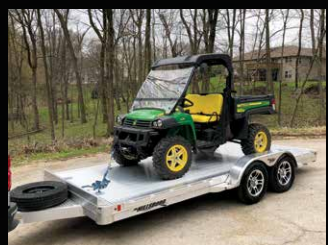
16' tandem car trailer