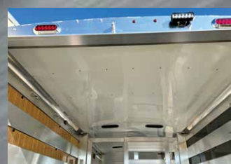
Lined and insulated roof, load light and pop-up roof vents