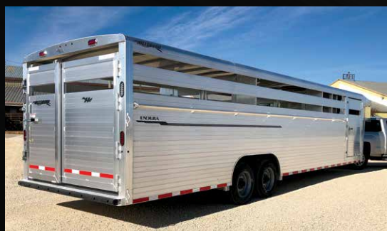
8' x 2' x 32' stock trailer with external tie rail, 10k axles and backup lights