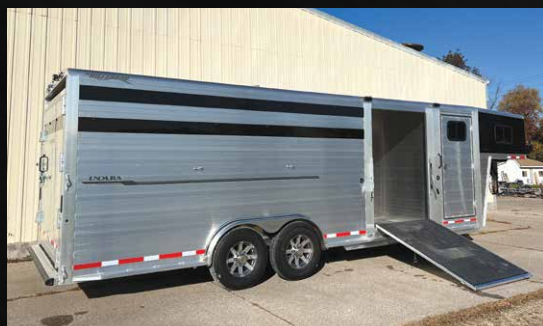
7'6" x 26' combo with 4' straight-wall tack room, windows in nose and door, 52" side ramp, outside tie rings, unload lights at rear and side, plexiglass and aluminum wheels