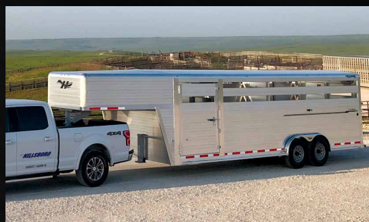
7' x 22' standard livestock trailer