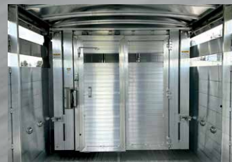
Adjustable sliding center gate in front of fenders