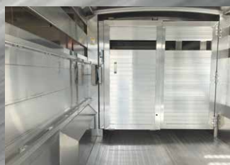
2 inside tie rails, plexiglass with standard fixed center gate with slider in a 7'6" wide trailer