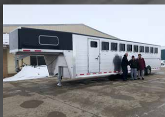
Drop-down feed doors, windows in nose and door, black painted nose and roof cove, and aluminum wheels on triple 7k axles