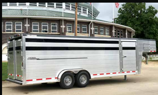
7' x 24' with black painted roof cove, plexiglass, rear load light and side GN slam door