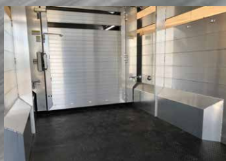
Adjustable solid center gate, rubber on floor in a 7'6" wide trailer