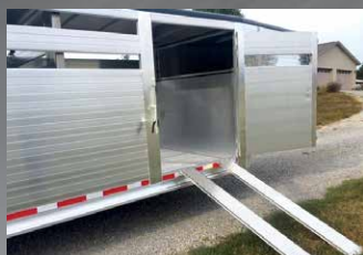
EZ store ramps, 52" escape door and black painted roof cove