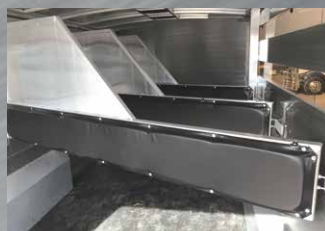
Padded slat dividers