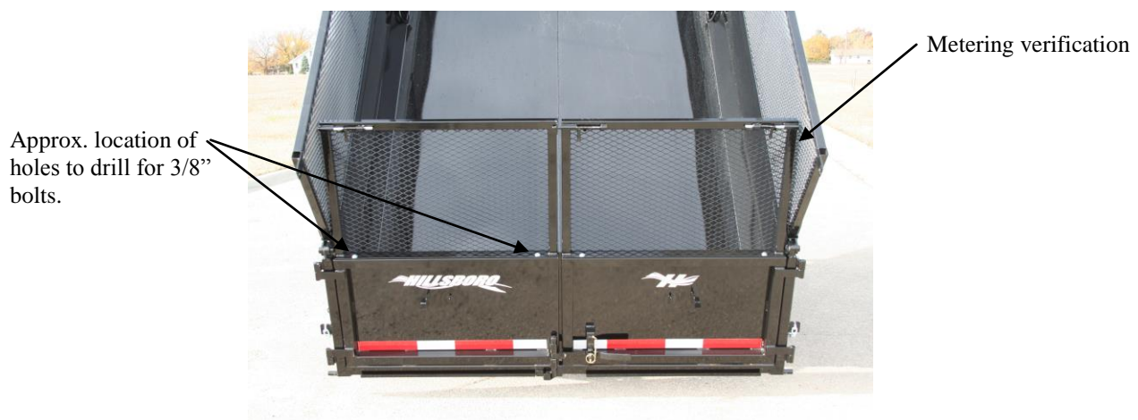
Figure 3 Rear Extensions

Locate the left hand rear extension. Clamp extension onto left gate, offsetting the right hand side 1/8" from edge of gate. Verify that the extension will not interfere with the left side extension when metering. Drill (2) 13/32" vertical holes thru the extension and gate (Figure 3), and secure with (2) 3/8x1-1/4 HHCS, (4) 3/8 flat washers, (2) 3/8 lock washers and (2) 3/8 hex nuts. Locate the holes on the bottom of the extension and drill (2) 13/32" horizontal holes into the gate. Install (2) 3/8x1-1/4 HHCS, (4) 3/8 flat washers, (2) 3/8 lock washers and (2) 3/8 hex nuts from the inside of the trailer. Install the right hand rear extension in the same manner.